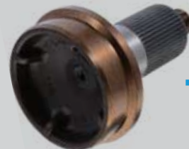
Midship Stub Shaft