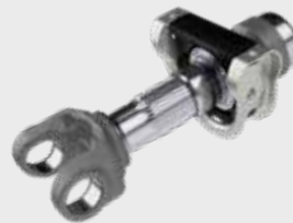
SPL Lite Midship