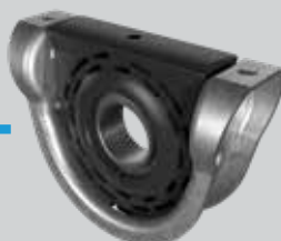
Dura-Tune Center Bearing